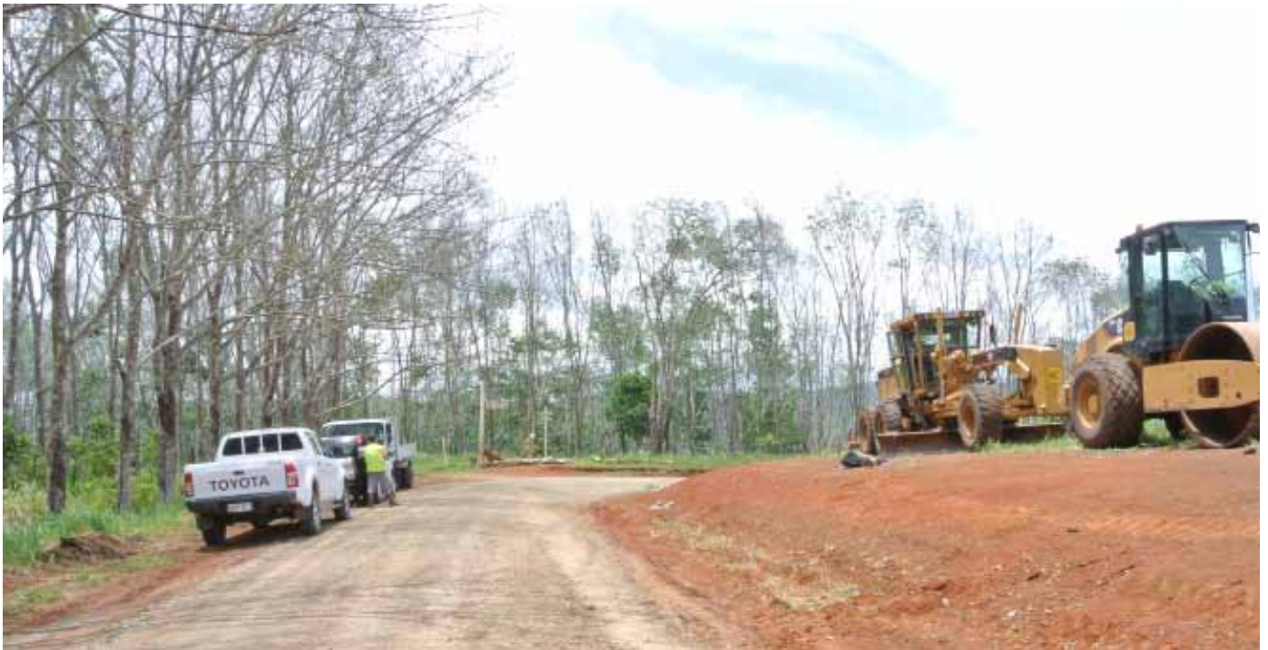
NC Civil Works fixing the road at Owers Corner.

In early november the radio maintenance program started. And as expected the locals plus KTA staff have assisted the technicians in maintenance activities along the entire length of track.