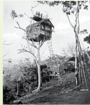
Koiari Culture: The Koiari people are known for their Dobo Tree houses

One important point raised by many of the presenters was to preserve and manage the knowledge and practices that make us unique and special. From all that have been presented, Kokoda Track Authority is proud to say that as, a Special