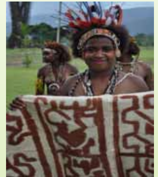
Kokoda Culture: The Oro Tapa is a significant identity of the people of Oro

Purposes Authority of the Kokoda and Koiari Local -level Governments we have and will continue to safe keep and manage the Kokoda Track and its culture so the world must know the history, the values and the importance of this place.